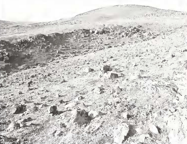
Fig. 1: Leiurus abdullahbayrami, adult fe- Fig. 2: Envenomation locality in Kilis Province close to the Syrian Fig. 3: Sting site at the time the patient border